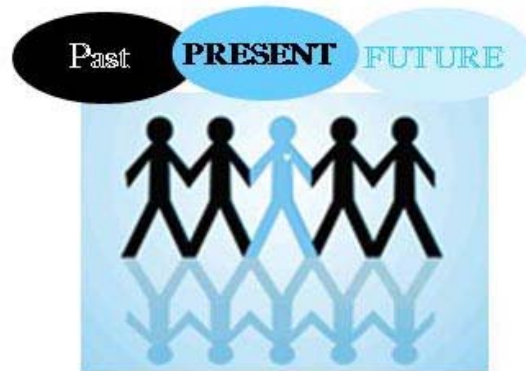
"20 years and Still Growing Strong"